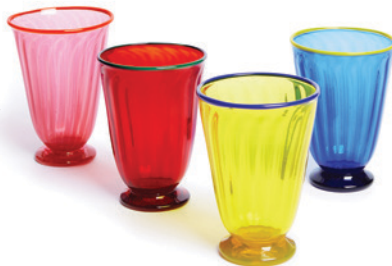
LA DOUBLE J'S FASHION AND HOMEWARE COLLECTIONS FEATURE STYLE SIGNATURES OF BRIGHT COLORS, LUXURIOUS FABRICS, AND VINTAGE PRINTS.